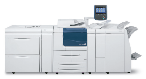
Xerox® D Series Copier/Printer

With the Xerox® C60/C70 and Xerox® D Series, you can do it all, from start to finish.