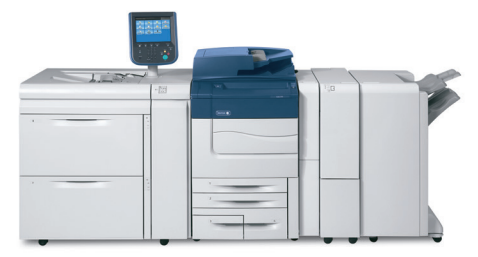
Xerox® Colour C60/C70 Printer