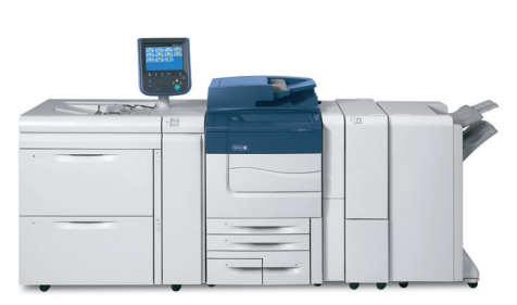
Xerox<sup>®</sup> Colour C60/C70 Printer

Reduce operating costs – With common feeding, finishing and the same type of user interface, the Xerox<sup>®</sup> C60/C70 and Xerox<sup>®</sup> D Series are easy to use; with minimal training, an operator can run both your colour and monochrome devices, increasing productivity and optimising resources to operate and maintain multiple devices.