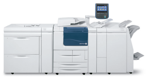
Xerox® D Series Copier/Printer

To learn more about this unique programme and how you can implement it in your institution, contact your Xerox sales representative.