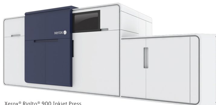
Xerox® Rialto® 900 Inkjet Press

PM Solutions had a goal: Transform their operation by eliminating the cost and inefficiency of litho shell production. But in terms of economics and output quality, inkjet didn't seem to cut it in the SMB market. Until Rialto.